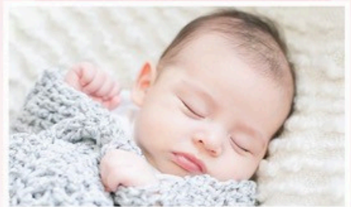
Another of our precious True Care babies