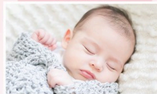
Another of our precious True Care babies