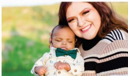
Meet some of our beautiful True Care Babies

*All stories are shared with patient consent; however, names and certain details have been changed to protect confidentiality.